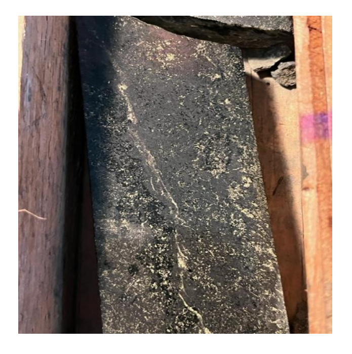
Plate 1: Representative sample of drill core containing semi-massive chalcopyrite and gold in a garnet-epidote skarn in the northern portion of the MZM, Silver Hart