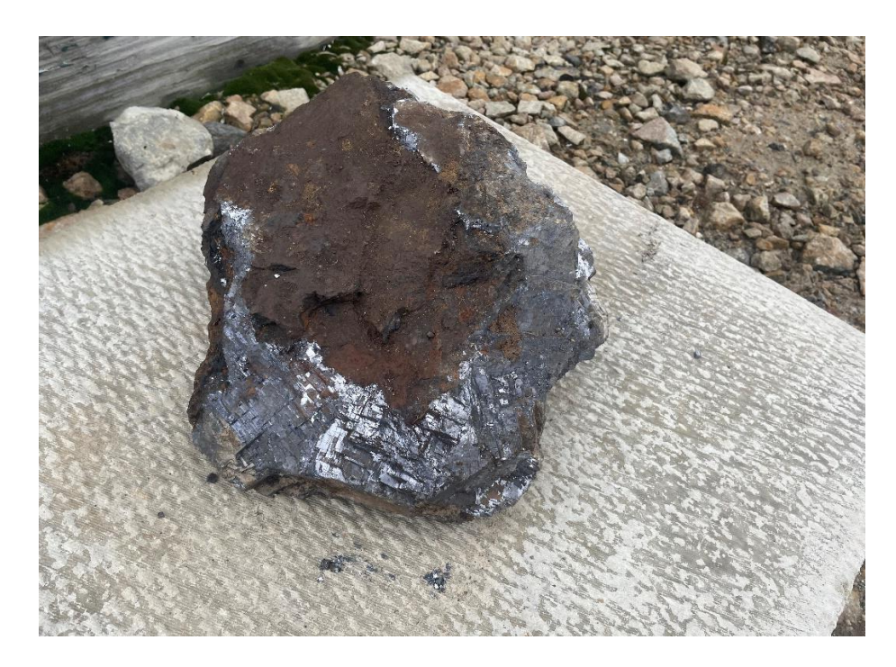
Plate 2: Sample of massive galena from the Golden Cross trenches, Blue Heaven Property.

Also in the Golden Cross trenches are evidence of stacked mantos of variable thickness along with thin intersections of massive galena (see Plate 2), which are being mapped and sampled.